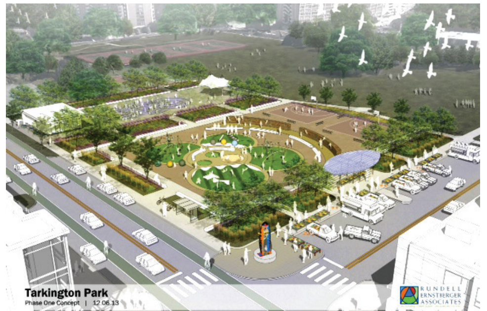
Tarkington Park: Phase I (Estimated completion: Fall/Winter 2015) Catalyst Redevelopment Strategy: Tarkington Park Phase I-$5 Million