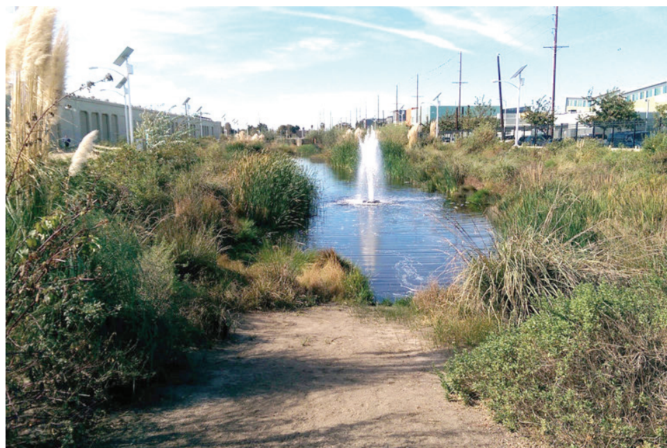
The South Los Angeles Wetland Park has earned the Envision platinum award.